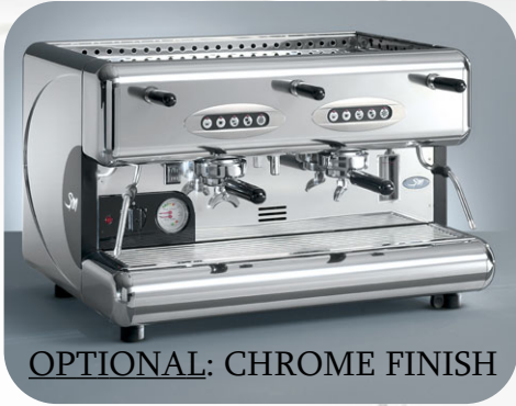
OPTIONAL: CHROME FINISH